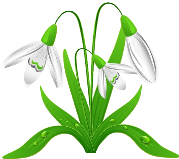
The Snow Drop